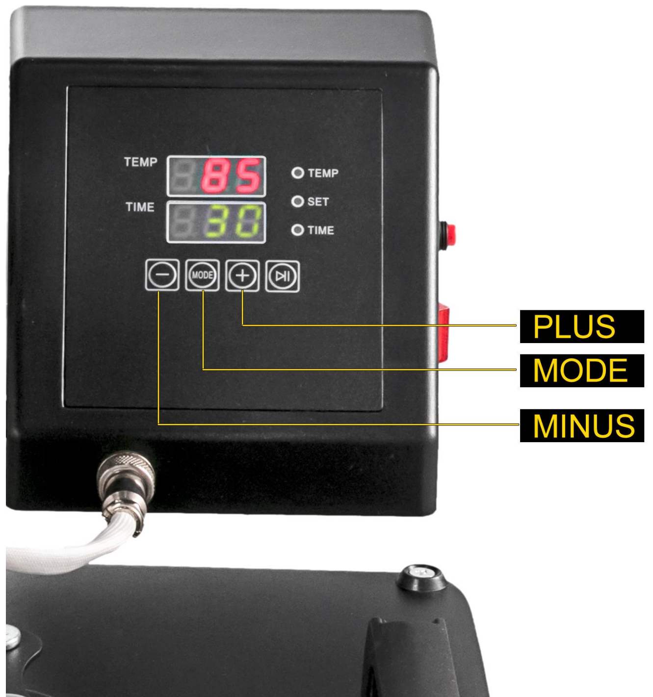
Digital Practical Controller

The controller has a marvelous and gorgeous appearance, featuring the digital display and button. You only need to press one time to realize a simple & quick operation.