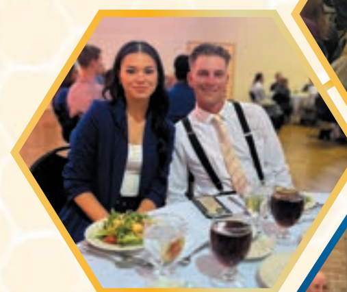
SPDP Etiquette Dinner 2023