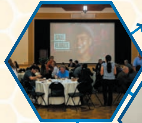
Community Breakfast 2023