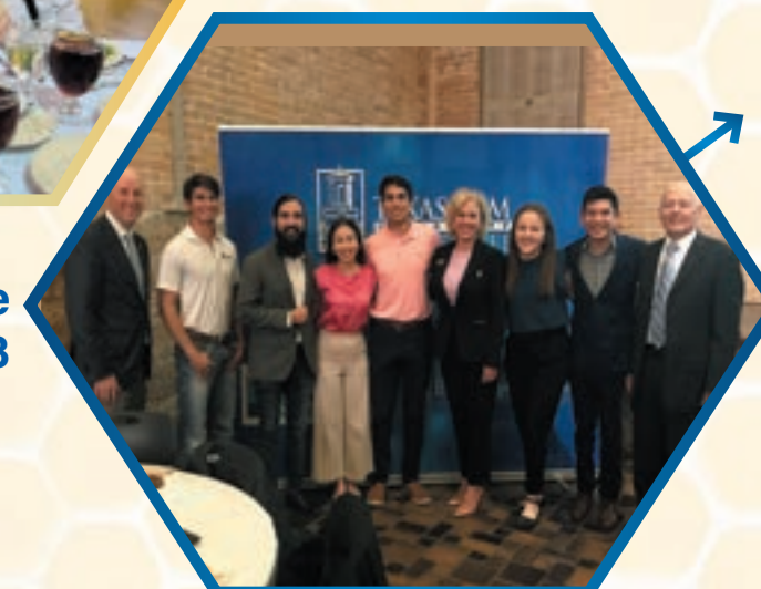
Economic Forum 2022