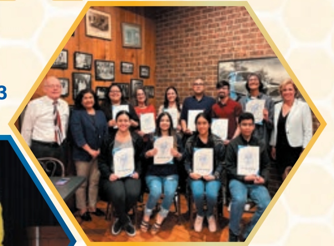
Volunteer Income Tax Assistance (VITA)